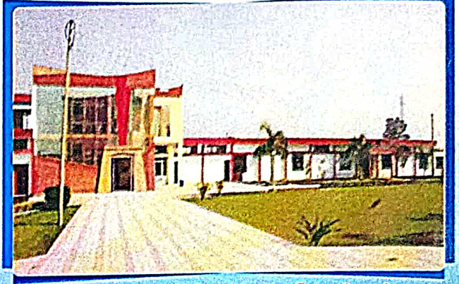
Admin Block & Panchkarma Department