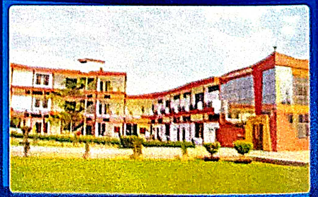
Library & Departments of Anatomy, Toxicology, Pharmacy & Pharmacology