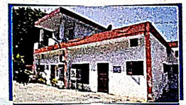
Staff Residential Complex

There is a well furnished examination hall.