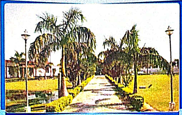
Palm Lane Leading to Canteen