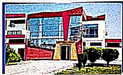
Administrative Block of the College

The institute has a beautiful magnificent building and an eye catching landscaping view with a fine blend of architecture and natural out look. There has been crores of rupees expended on it so far. Yet the management has further plans of its expansion & development.