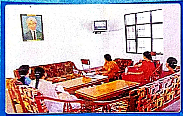
A View of Common Room in Girls Hostel