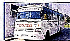
Mobile Hospital Unit for Outdoor Medical Camps