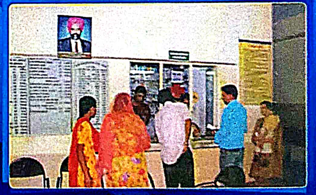
A view of drug store