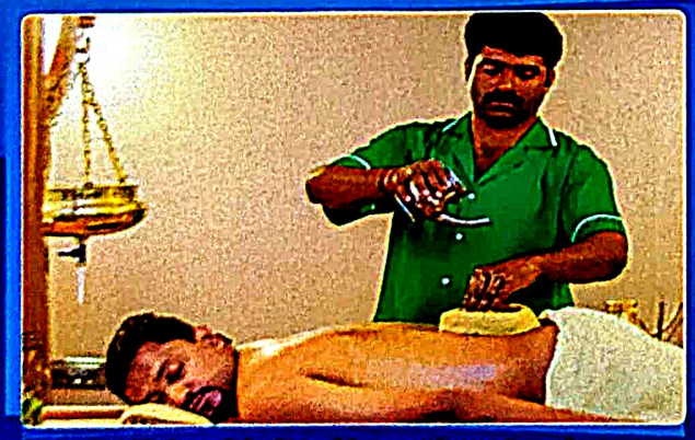
Kativasti in Panchkarma Department