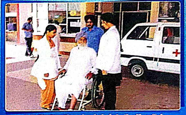
A Patient on the wheel chair in the Hospital