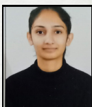
BAMS 2ND Prof.