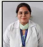
BAMS 3RD YEAR