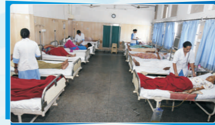
General Ward of the Hospital

1. OPD and Indoor Department : The hospital provides round the clock consultation at a very nominal fees and has separate male & female general wards, as well as private rooms & intensive care unit.