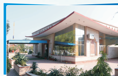
Sri Gurudwara Sahib

Sri Gurudwara Sahib : Provides spiritual satisfaction and solace to the devotees.