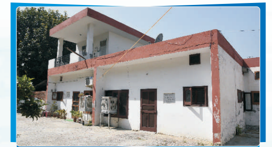
Staff Residential Complex

There is a well furnished examination hall.