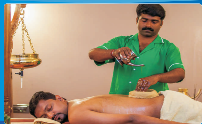
Kativasti in Panchkarma Department