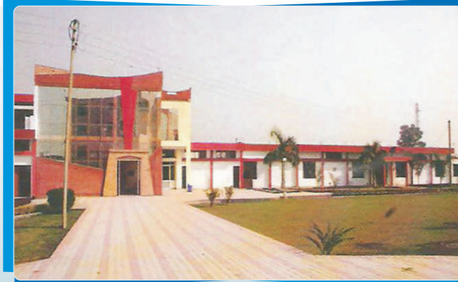
Admin Block & Panchkarma Department