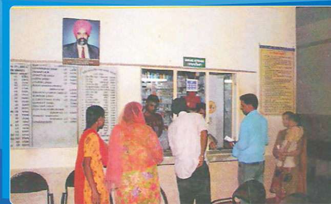
A view of drug store