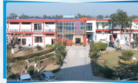
Administrative Block of the College

SKSS Ayurvedic Medical College, Sarabha is dedicated to the Great Martyr Kartar Singh Sarabha who sacrificed his life in the prime of his youth for the freedom of India. SKSS is a reputed institution situated in his native Village Sarabha (Dist. Ludhiana), Punjab. This college is recognised by NCISM, New Delhi & AYUSH a body of Govt. of India & affiliated with GRAU, Hoshiarpur Punjab. It's one of the most prestigious Ayurvedic College in the state of Punjab and providing the best Ayurveda Education & treatment facilities. The institute has a beautiful magnificent building and an eye catching landscaping view with a fine blend of architecture and natural out look.