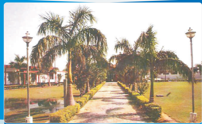
Palm Lane Leading to Canteen