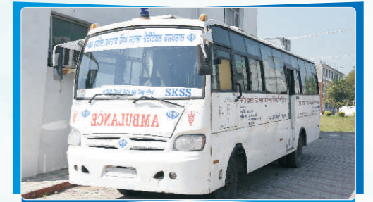
Mobile Hospital Unit for Outdoor Medical Camps