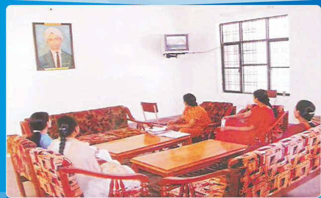
A View of Common Room in Girls Hostel