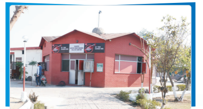
Refreshing Spot - The Canteen

Canteen : The institution has a hygienically maintained canteen which serves to the taste of the students, teachers and the visitors. The students enjoy their free moments with snacks, tea and cold drinks, thereby creating the fine blend of energy and refreshment.