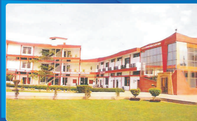
Library & Departments of Anatomy, Toxicology, Pharmacy & Pharmacology