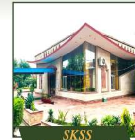
SKSS Gurudwara Sahib