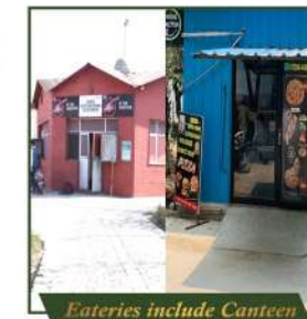
Eateries include Canteen & Foodies Junction