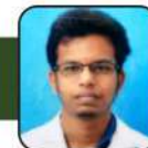
Lovish 1st Position