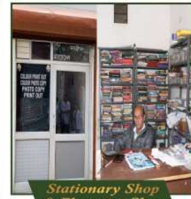
Stationary Shop & Photostat Shop