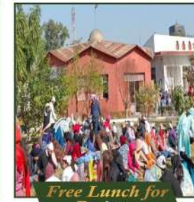
Free Lunch for Patients