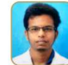
Lovish 1st Position