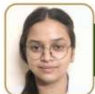
Money 3rd Position